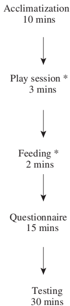
FIGURE 1 Outline of the protocol for the visit to the volunteer dog owner's home including approximate durations of each stage. *Filmed via camera held by experimenter; all other parts filmed by camera on tripod.

The experimenter (Nicola Rooney) visited each dog owner in his or her own home once. The visit lasted approximately 1 to 1.5 hr. When possible, it took place at the dog's usual feeding time and when the owner and dog were alone. When other family members were present (12 cases), they were requested to remain in a different part of the house and to avoid interrupting the procedure or attracting the dog's attention. The visit followed the protocol outlined in Figure 1.